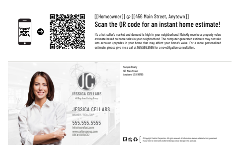
Branded - Postcard Back