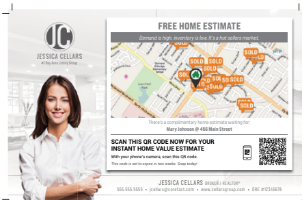
Branded - Home Estimate Map Postcard