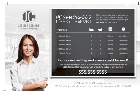
Branded - Neighborhood Market Update Postcard