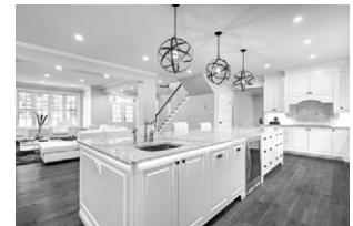
Custom Background Image