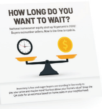
Hot Market QR Code Postcards