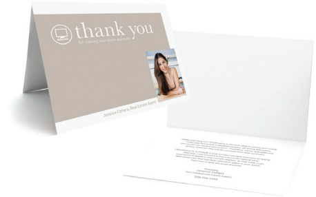
Home Estimate Follow Up Note

Following up with new Home Estimate leads is now easier than ever. Jessica loves using these notecards to reengage with each lead to offer her personalized services and strengthen the relationship.