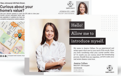
Agent Announcement Postcards