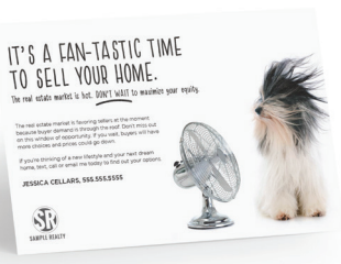
Bright Side Postcards

She is committed to marketing to her farm and sphere. She sends out personalized direct mail and immediately follows up with any lead she receives.