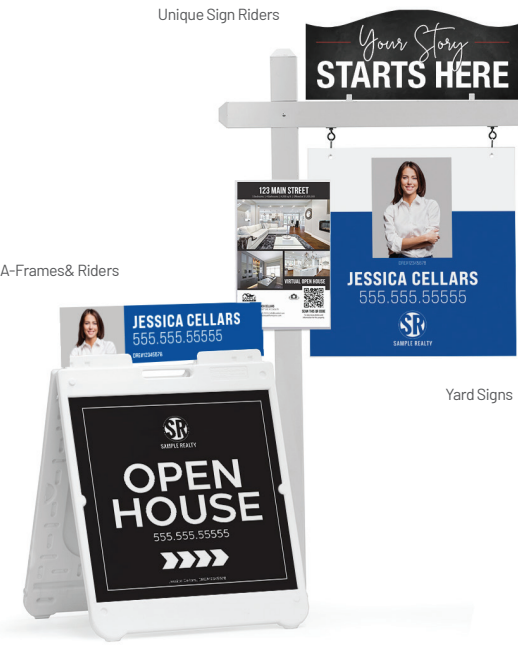
A-Frames & Riders