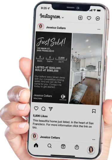
Coordinating Social Media Posts from Social Share

Ready to get started? Set up your account for free at www.corefact.com