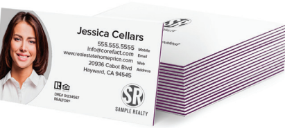
Luxe Triple Paste Business Cards