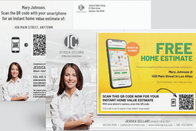
Elite Automated Direct Mail